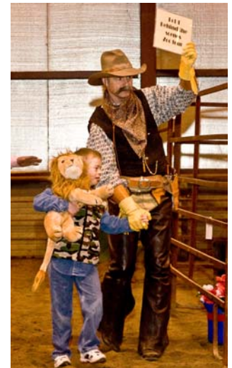
HETRA Student helps show off a live auction item

American Flag flown over Afghanistan, Minnesota cabin stay, romantic picnic at James Arthur Vineyards, NASCAR tickets, Airline Tickets, additional autographed items and numerous area gift certificates and great items for kids of all ages! To purchase tickets go to our web site www.hetra.org or call us at (402) 359-8830.