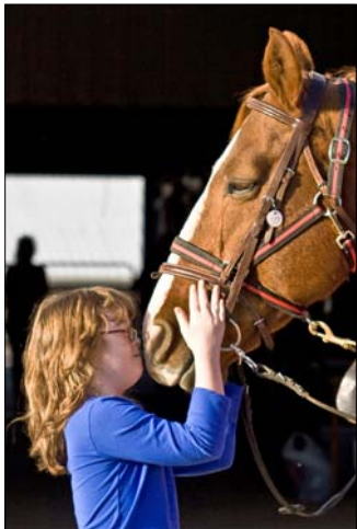
HETRA student in 2008