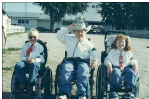
A few of HETRA's first students