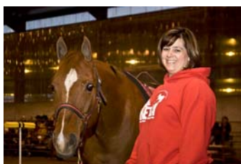
"Jessie" 2008 Horse of the Year

This year's winner will be announced at Blue Jeans and Dreams on March 28th.