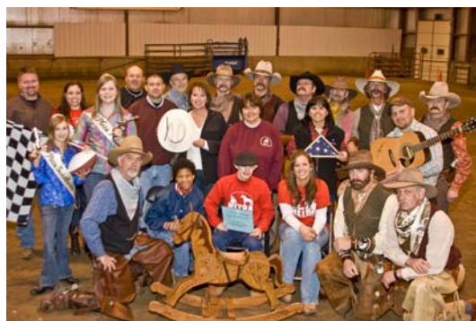
2008 Live Auction Winners

23203 Dutch Hall Road in Bennington. The evening's festivities will begin at 5:00 with a social hour and silent auction. Dinner will be served by Skeeter Barnes BBQ. Mark Lyon and Christian will amaze the crowd at 7:00 and the HETRA students are scheduled to perform at 7:45 with the live auction immediately following.