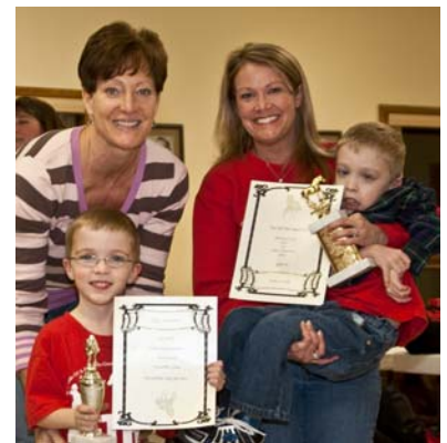
HETRA Students receive their awards

HETRA volunteers logged a record of more than 12,500 hours in 2008, many of which were spent in sessions with a record number of 90 students per week - that is beyond amazing! There were a lot of volunteer hours spent planning and putting on several fundraising events, without which HETRA couldn't continue to operate. Volunteers used their hours to purchase HETRA apparel and to bid on dozens of wonderful items donated by HETRA students and their families. Words cannot express how grateful all of the HETRA staff and the families of our students are for all of the time, energy, talent and love that each volunteer contributes towards the success of our program!! We're all looking forward to another great year in 2009.